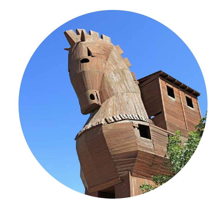
Troy Ancient Site