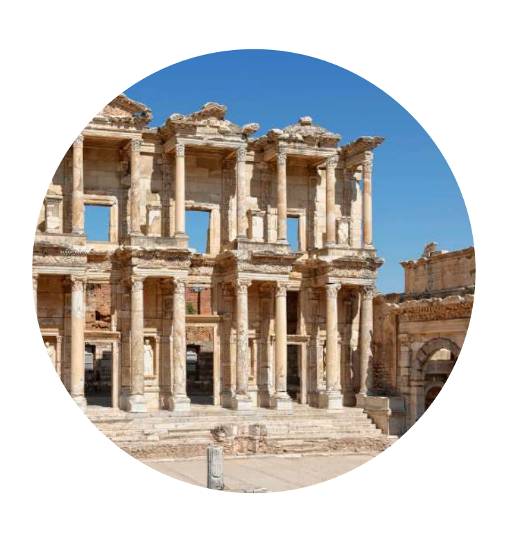
Ephesus Ancient City