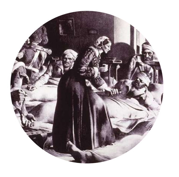
Florence Nightingale Museum